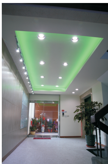
Factory lobby with BOBBY-MR16-WHT track lighting and BOBBY-PAR30-WHT downlights.

NOTE: Do not use in outdoor or wet/humid areas or in totally enclosed fixtures.